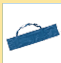
Art. No. 7586

Art.No. 7584 Ground spike. Length 60 cm. Suited for hard soil and sand beach as well.