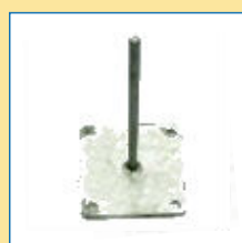
Art. No. 7971