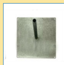
Art. No. 7142