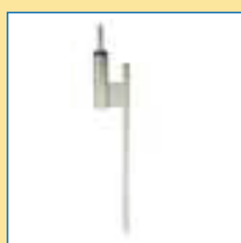
Art. No. 7584

From base pin to umbrella stand, which can be filled with water, it can be used to install the Aventos construction as a representative eye-catcher. It is important that the stand can continuously rotate 360 degrees at all times. The fastening options detailed below are the most frequent sold options. Alternatives can be discussed with our Sales Department. The Aventos is delivered including a steel base pin as a standard, and packed in a luxurious polyester carrying bag. Other options can be discussed.