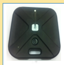
Art. No. 8006