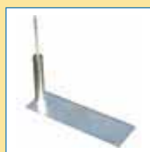
Art. No. 7358